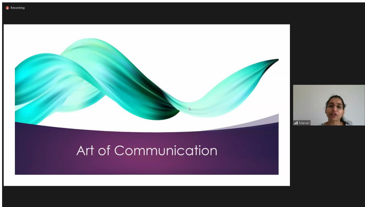
PHOTO OF EVENT