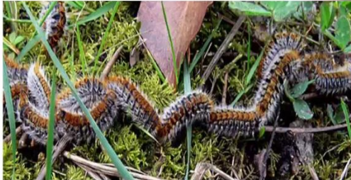
Caterpillar In lock steps