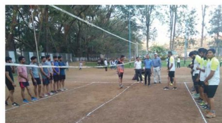
Karmaveer Sports Fest 2020 Volleyball Tournament