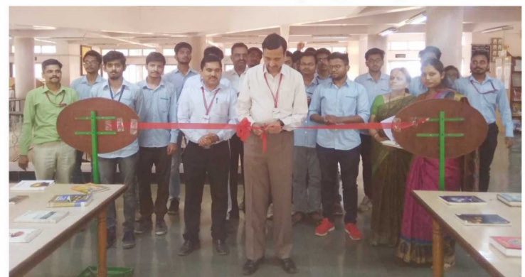
Inauguration of Exhibition of Marathi writers' literature

International Mother Language Day was observed by ISTE Students' Chapter of K. K. Wagh Institute of Engineering Education and Research, Nashik on 22 nd February, 2020.