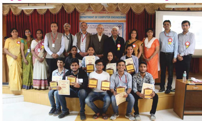
Winners of VIJIGISHA 2020 along with Judges & Chief Guest