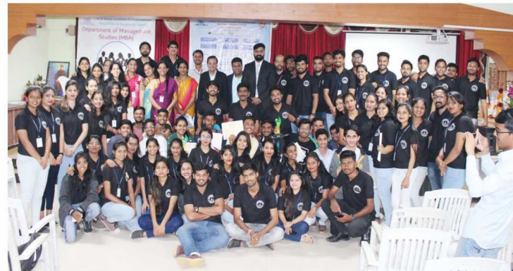
Maverick-2020 group photo with winners and guests

The event 'Maverick' was organized with the dual purpose- To provide an opportunity to the undergraduate students to visit and see a professional education Institute and to show their talents in various competitions held during this event. It also provided an opportunity for MBA students to learn how to organize an event from planning stage to the end. This year the