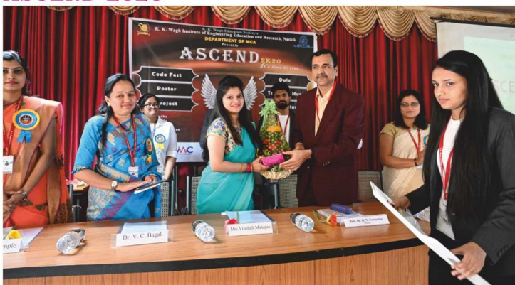
Participants of ASCEND 2020 along with staff of MCA

Department of MCA organized state level technical symposium ASCEND 2020 on 17 th and 18 th February 2020. Undergraduate students from many colleges participated in this event. Competitions like Poster Gallery, Code Fest, Project competition, Treasure Hunt, Quiz, web design, Pubg were conducted.