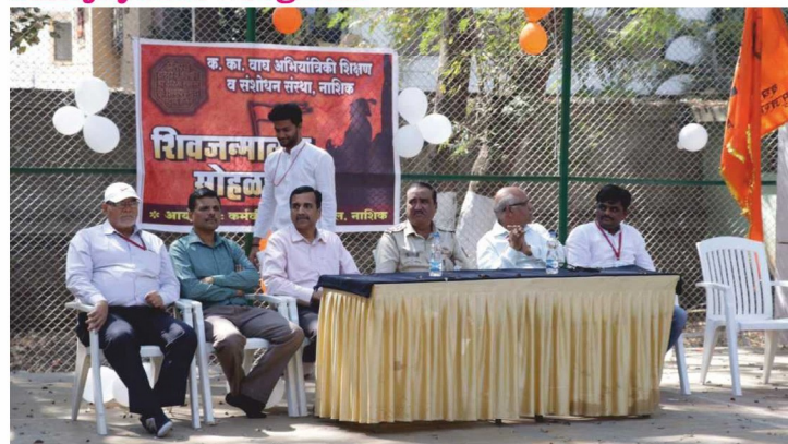
Shivjayanti Program on 19 th February 2020