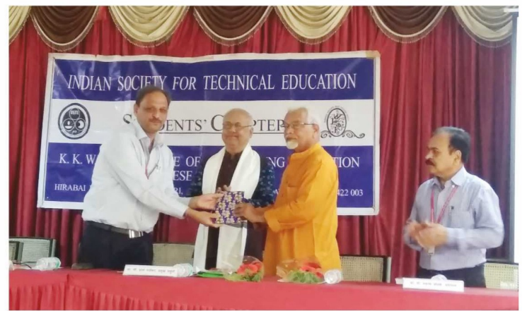
Celebration of Marathi Bhasha Gaurav Din