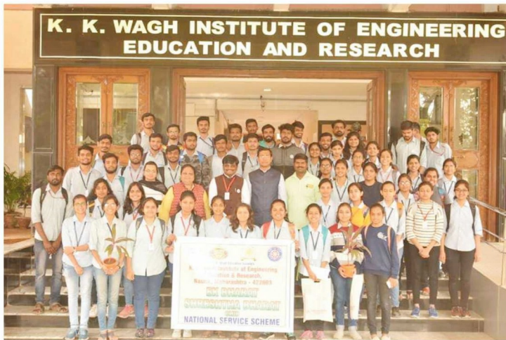
Inaugural of "Ek Bharat Shreshtha Bharat Club"