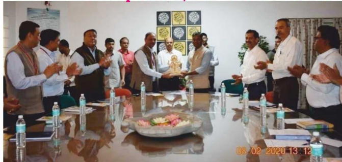
Visit by Hon. Sandip Kadam, CET Cell Commissioner