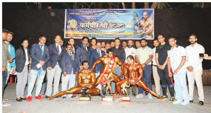
"Karmaveer Shree-2020" Body Building Competition