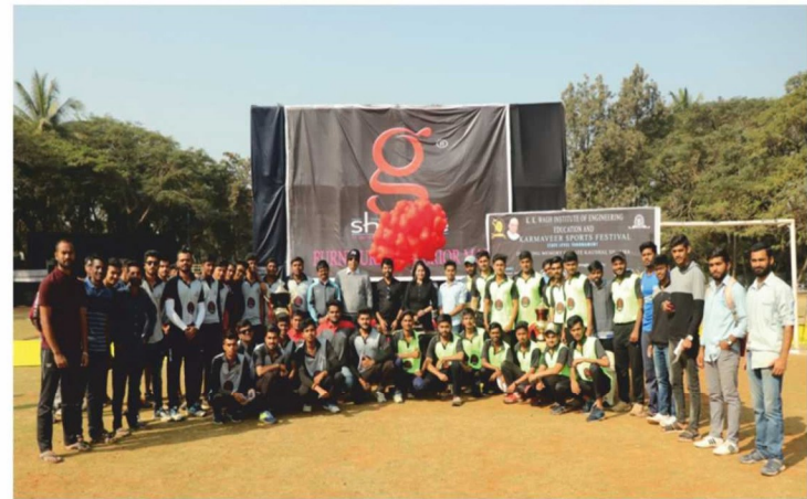
Karmaveer Sport Fest 2020 Inauguration